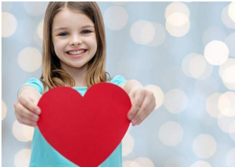
Sending kind wishes to ourselves and to others helps us feel better when we are down & nurtures compassion

Breathing is the heart of mindfulness. Breathing slowly and taking deeper breaths is a very effective tool to help lower symptoms of stress and anxiety, so you can be calmer and more relaxed.